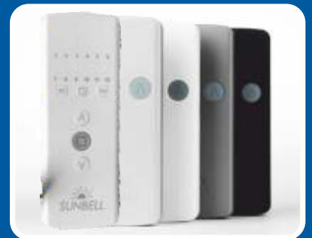
Remote & Actuators