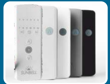
Remote & Actuators