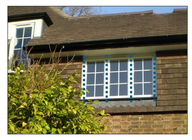
Figure 1.1: shows a Georgian style three pane casement window, which has many vertical bars. Horizontal Sliding secondary glazing can be made to sit behind this window discreetly.

Secondly - you will need to decide which of our secondary glazing systems you require. Bearing in mind the fact that, certain styles are unavailable in some of our secondary glazing systems. For example: Our Triple Track Horizontal Slider is only available with our Luxury Subframe system. The four systems available are our Economy Odd Leg system, our Slim-line Equal Leg system, Luxury Subframe system and our Heavy Duty system.