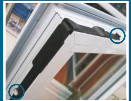
Locking Bolts On Three Sides