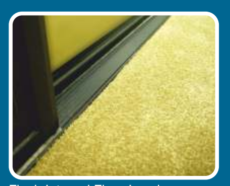
Flush Internal Floor Level